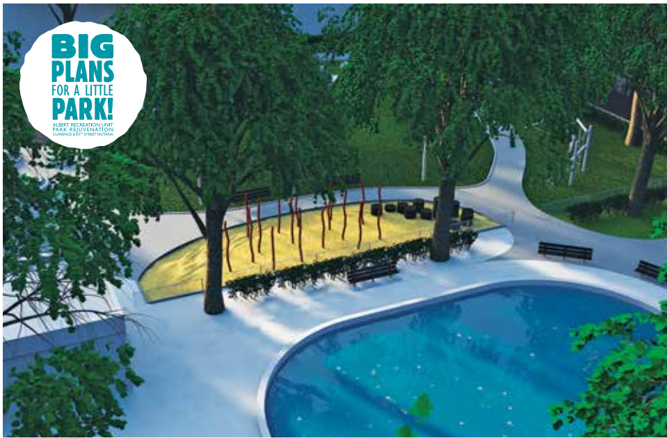
The centre piece of the rejuvenated park will be the red 'licorice sticks' play structure – a place for imaginative play, tag, climbing or strength training. Short height stepping logs will be nearby, serving as balance and agility structures for younger children and functioning as impromptu seating arrangements.