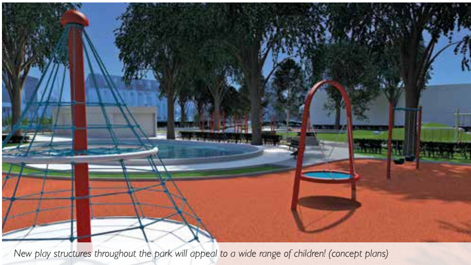
New play structures throughout the park will appeal to a wide range of children! (concept plans)